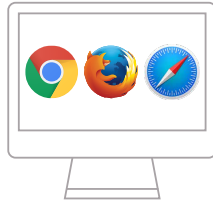
PC and Mac Chrome | Firefox | Safari